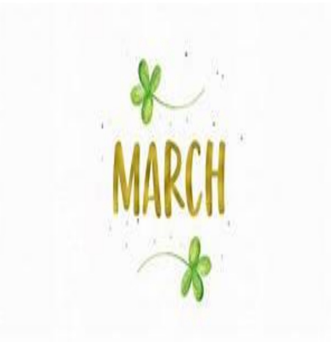
Student of the Month